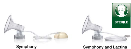
One-Day Pump Sets

The breastmilk bottles are graduated which enables easy checking of the content. In addition, you can note the infant's name, the volume expressed, as well as the time and date of expression on the additionally available label.