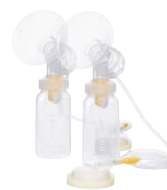
Symphony Pump Set