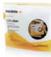
Quick Clean™ Microwave Bag