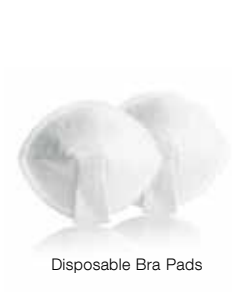
Disposable Bra Pads